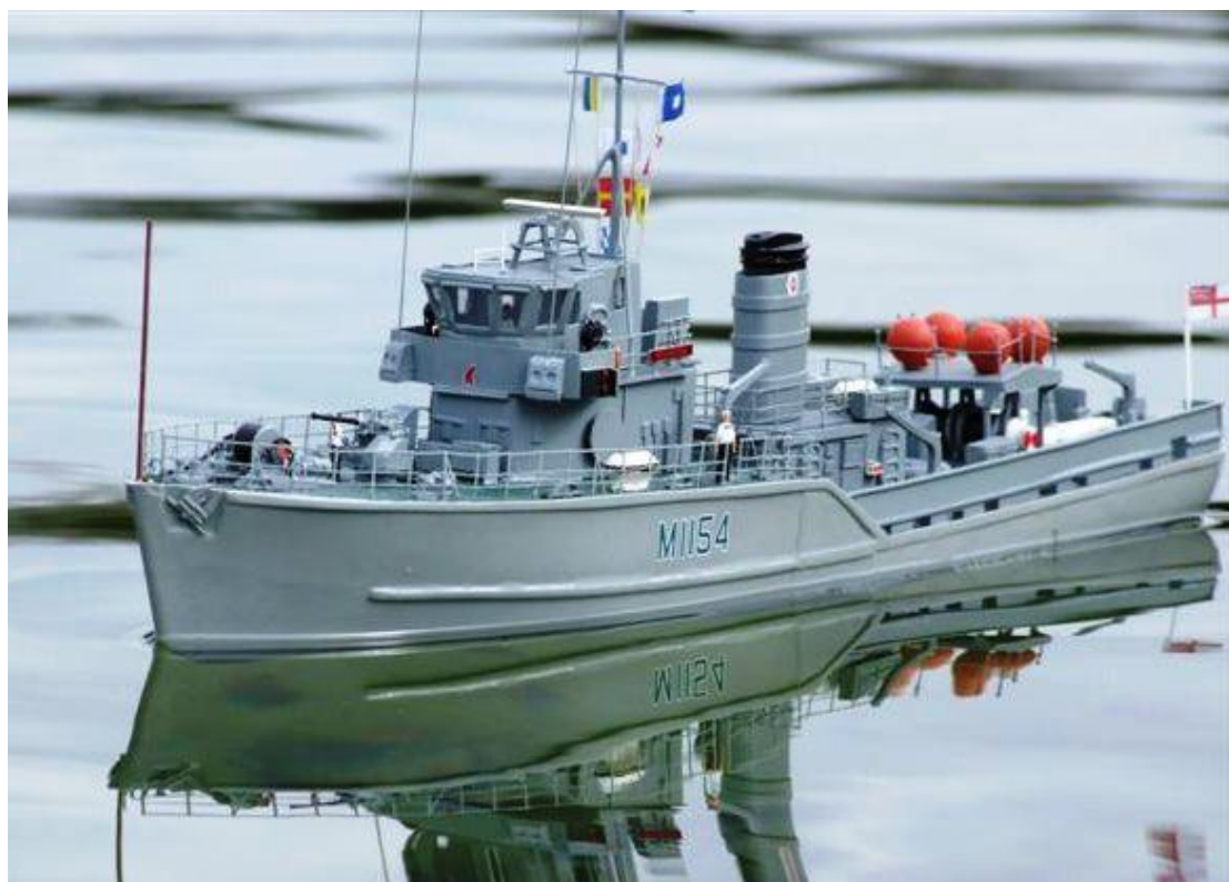
Nice Ton Class Minesweeper

At the end of the Newsletter is a for sale page, this is open to anybody & pictures are welcome (preferred) to accompany your ad'.