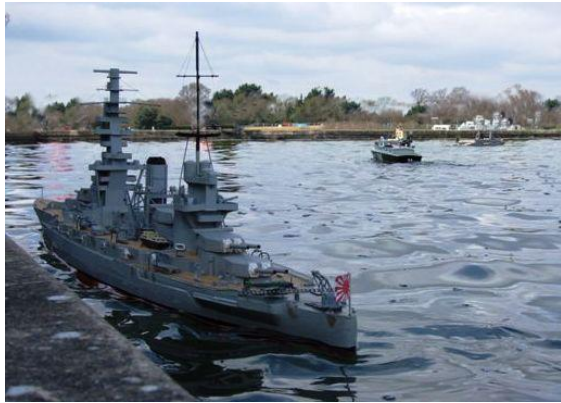
Background cloned out